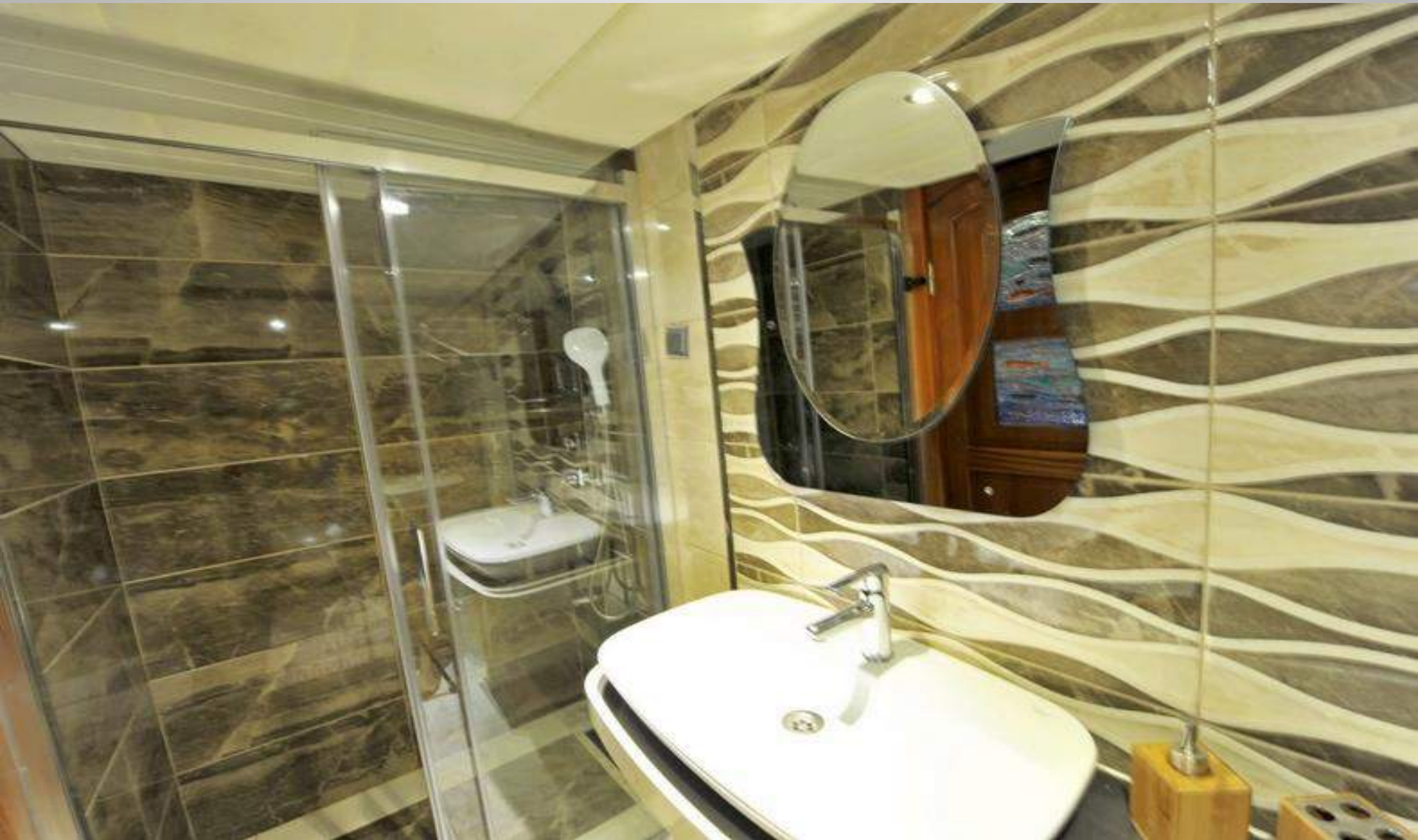
Double cabin bathroom